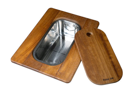
PLANCHE DE DECOUPE DOUBLE IROKO A644 F44