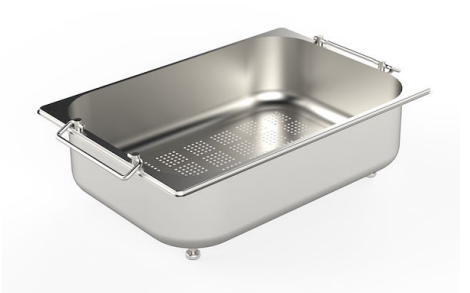
CUVETTE PERFOREE INOX A154 F00 * only in combination with the accessory A644 F04

CUVETTE INOX PERFOREE A151 FOO * only in combination with the accessory A644 A01