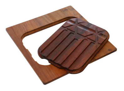
PLANCHE DE DECOUPE DOUBLE IROKO A644 F04